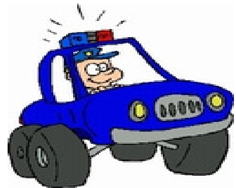
Slow down - speed limits are enforced!

If you are issued a ticket or notice you will be provided with information where you can contest that charge. Arguing or yelling at the officer will not cause the ticket to be removed.